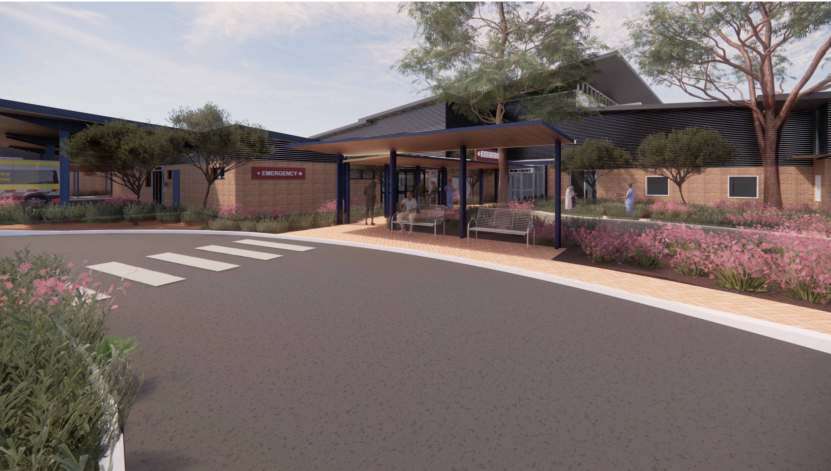
ED - DROP-OFF ZONE