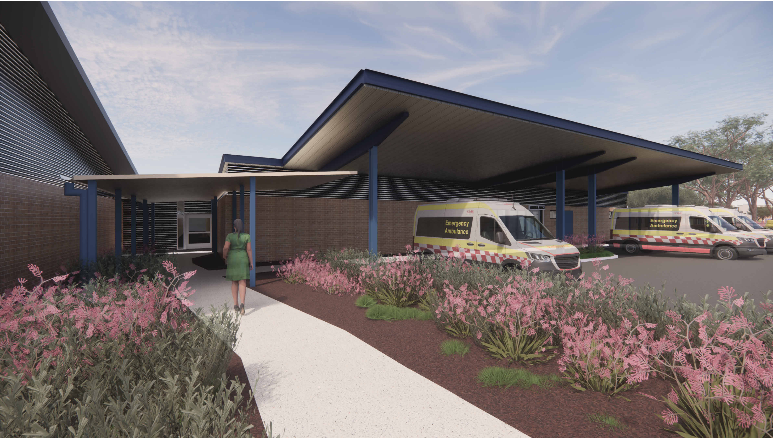
ED- STAFF ENTRY