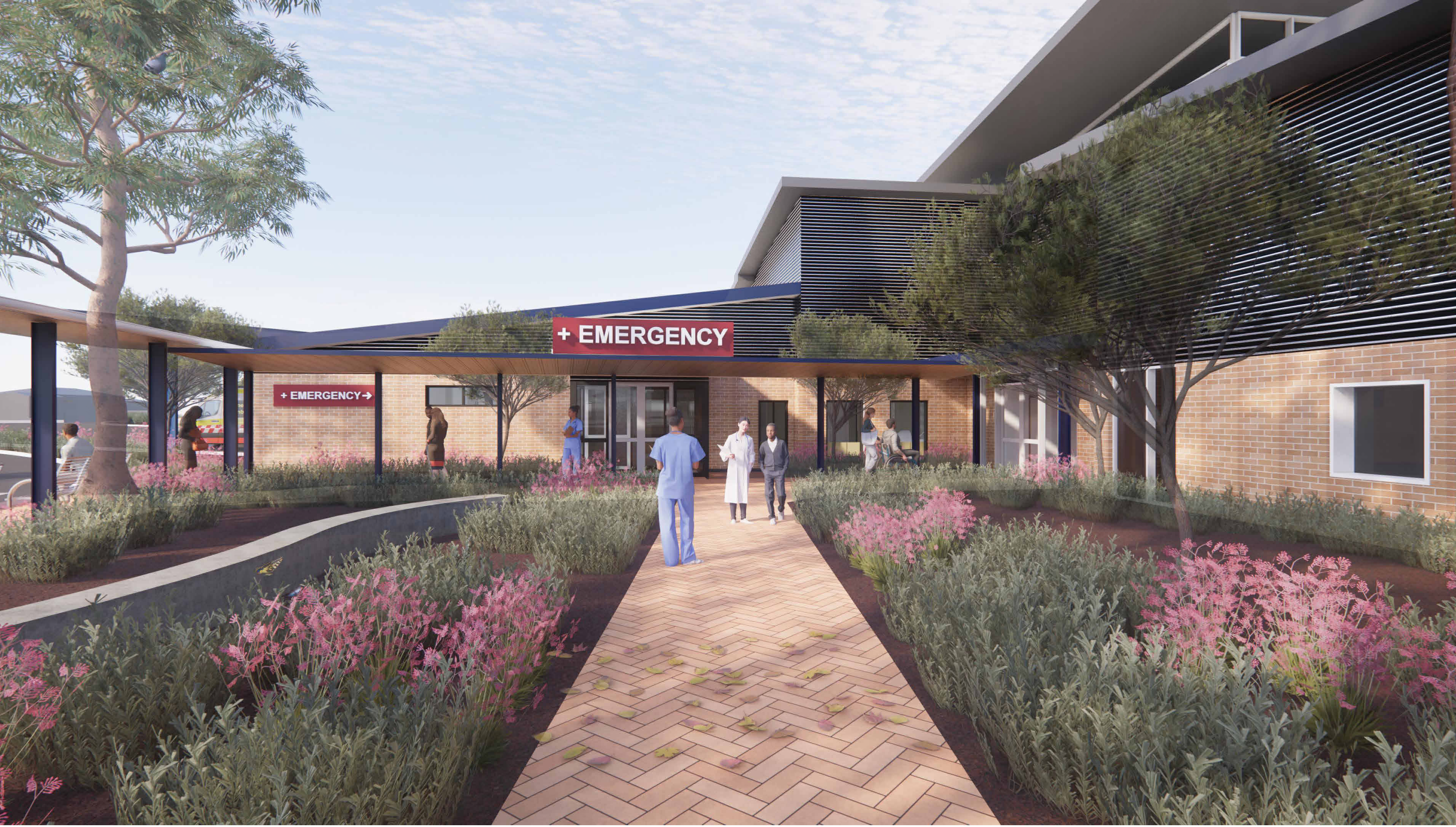
ED - PUBLIC ENTRY