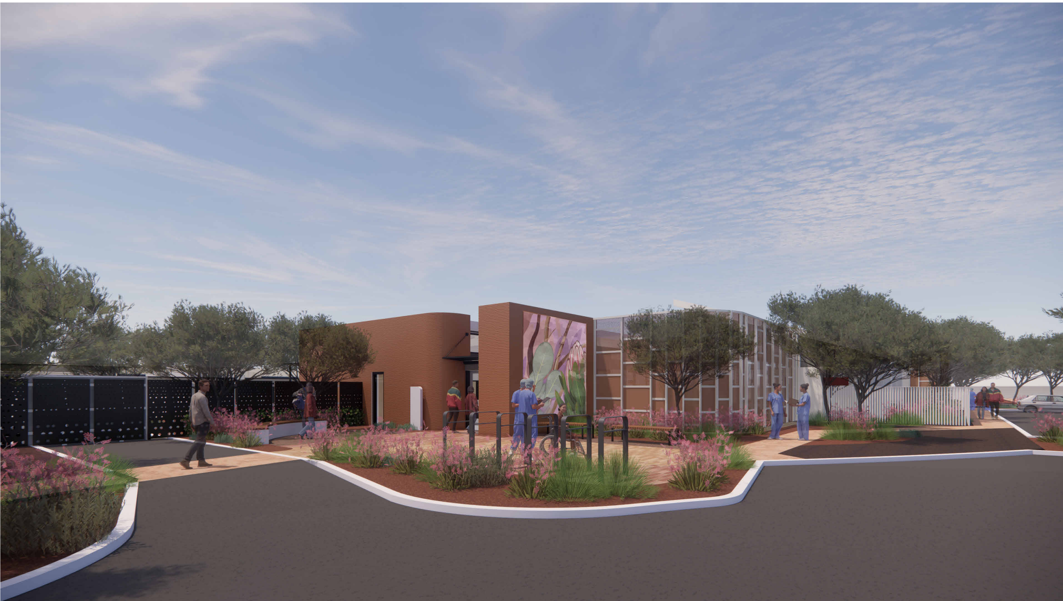
MHU - ENTRY