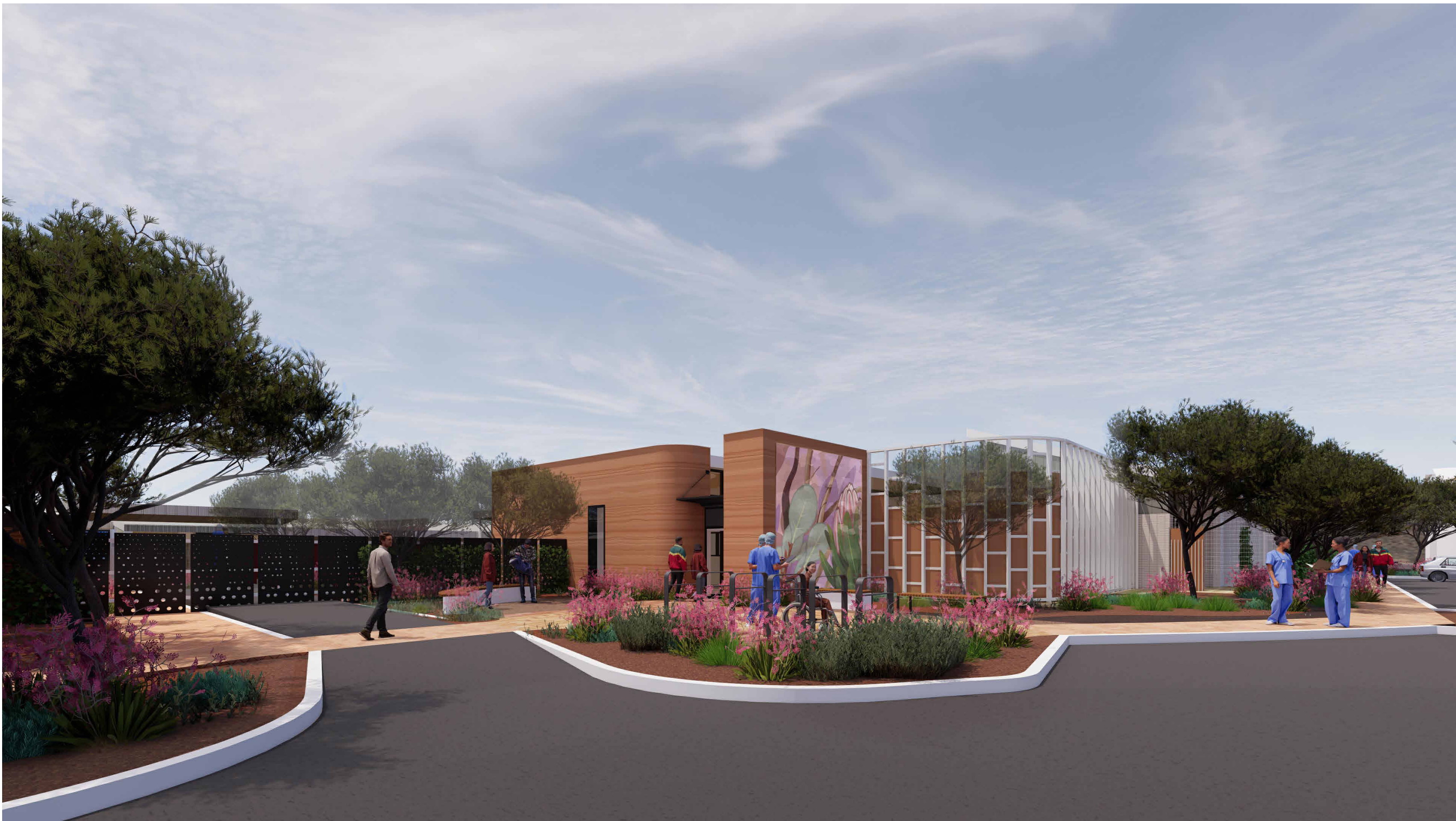
MHU - ENTRY