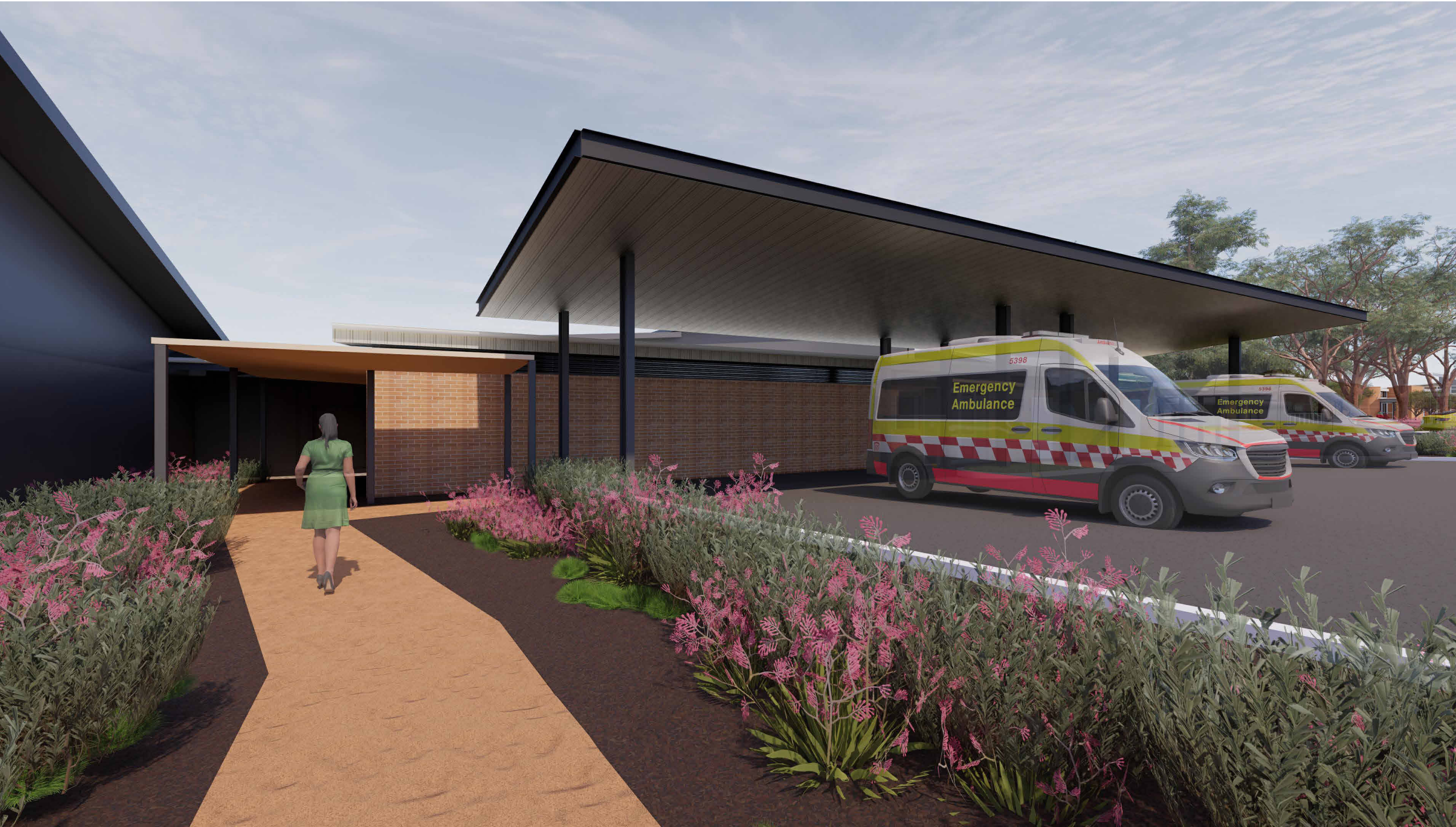
ED- STAFF ENTRY