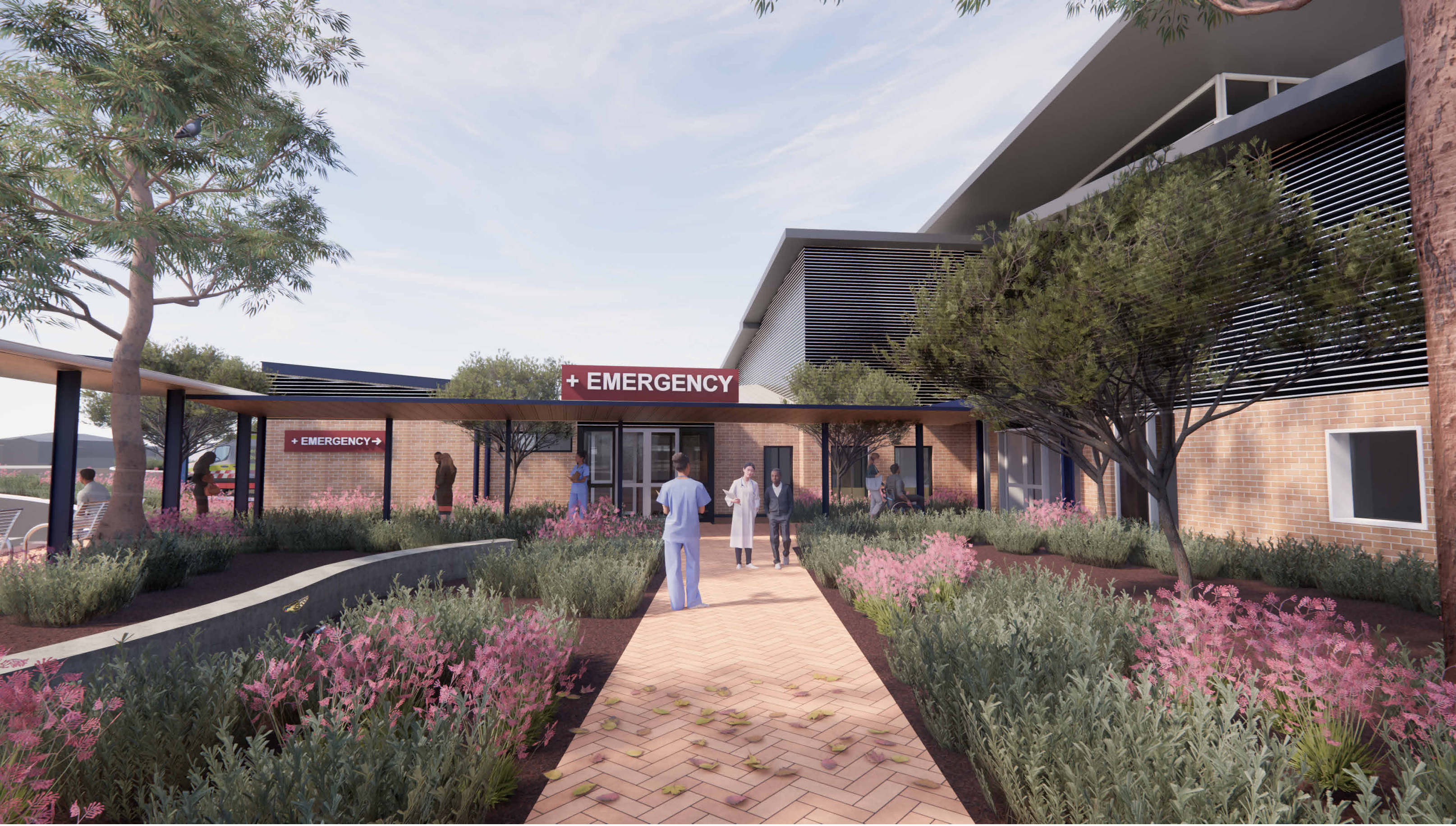
ED - PUBLIC ENTRY